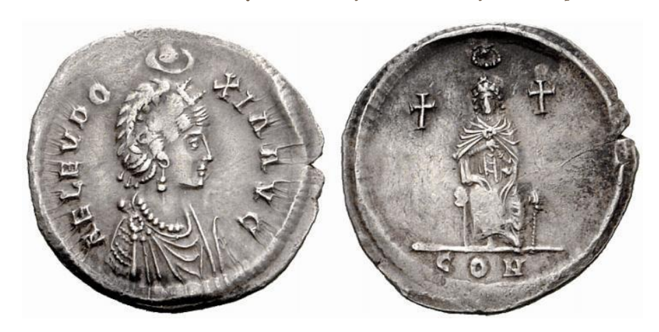
Fig. 4: Light miliarense of Licinia Eudoxia of the type "Empress on throne" (Numismatica Ars Classica NAC AG, Auction 33, Lot 617).