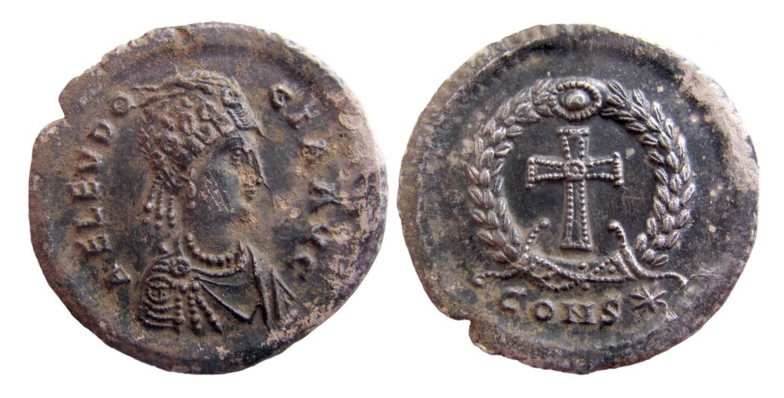
Fig. 1: Heavy miliarense of Augusta Aelia Eudocia from Nicopolis ad Nestum .

It's worth mentioning that the weight of the roman libra was reduced on several occasions. At the end of the 4<sup>th</sup> and the beginning of the 5<sup>th</sup> centuries it already weighed 322.6 gr. This number is estimated based on the study of collective finds, which were deposited between 380 AD and 500 AD, mainly in Central and Western Europe<sup>10</sup>.