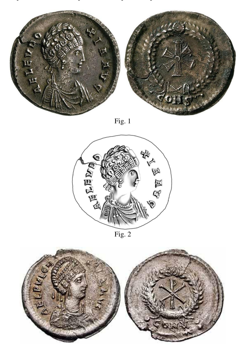
Fig. 3: Heavy miliarense of Aelia Eudoxia. Heavy miliarense of Pulcheria. The iconography shows big similarities to the coin of Eudocia. After (Numismatik Lanz München, Auction 100, Lot 651, CONS. RIC 46) (4).

It's likely that they affected not only the hinterland, but also the town itself. Till the 5<sup>th</sup> century Nicopolis ad Nestum was an important center in the structure of the Eastern Empire. Its character, usually described as agricultural, does not eliminate the possibility that the local aristocracy had direct contact with the court in Constantinople. Another potential route of origin is through commercial contacts with Thessaloniki. According to the historical sources, after the wedding in Constantinople, the young couple spent the winter there. It's only logical that the geographical proximity allowed for this exceptional numismatic piece to end up in Nicopolis ad Nestum.